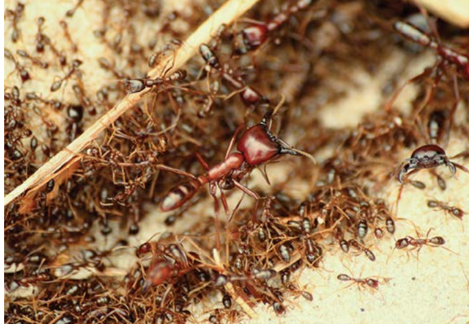
A marauding driver ant column, the bees' main enemy in the forest. The colonies number millions and it can take two or three days for a column to pass by

running ants to pass. Bees are vastly outnumbered when driver ants attack and usually the ants overwhelm the colony defences, invade the hives and eat everything. This is survival of the fittest in action. The population of bees must rely on its own fitness to survive; the beekeeper will not be there to help a struggling colony to pull through.